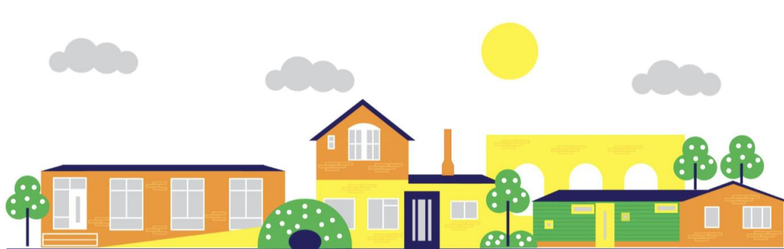
The Friends of St John's School, Digswell

Here is some useful information that is happening with the Friends.